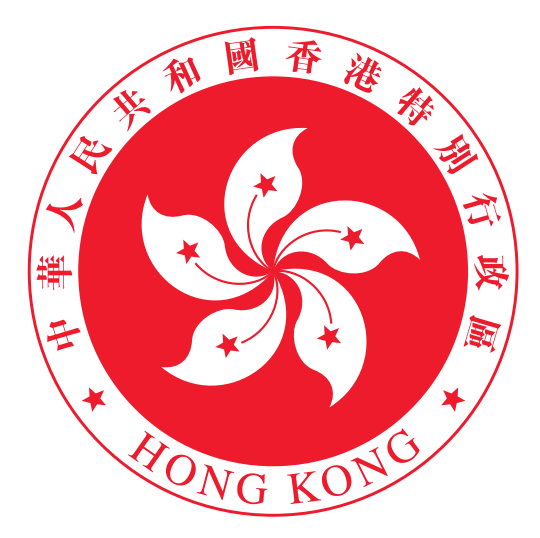
The Design of the Regional Emblem of the Hong Kong Special Administrative Region